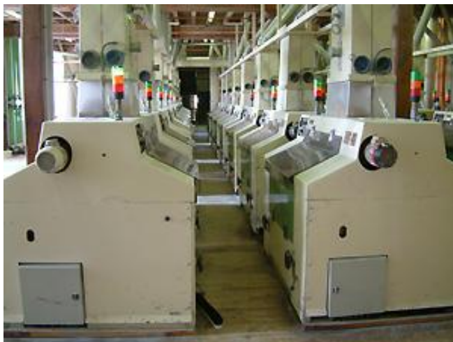
Series of Bühler mills